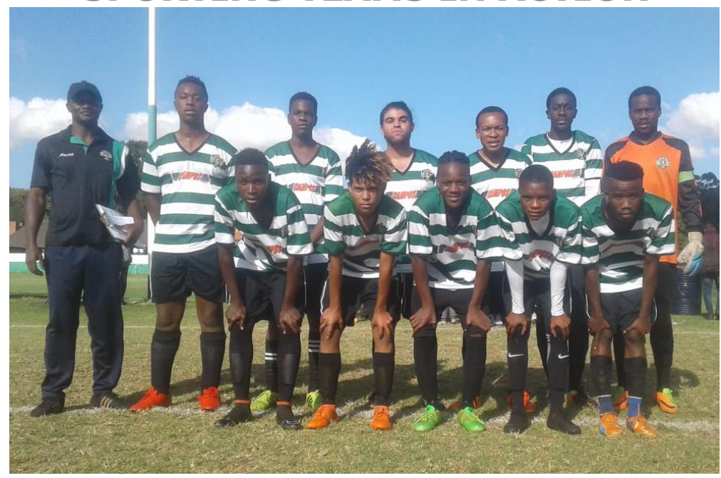
SENIOR DSL TEAM